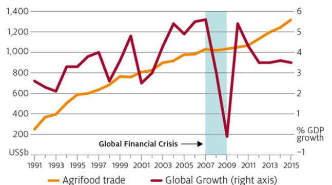
Global Trade in Agricultural Products during the Global Financial Crisis

Source: Greenville, et al. (2019), IMF Notes: Trade data discounted by IMF food price index.