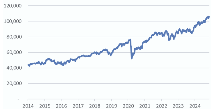
S&P/ASX Accumulation Index 2014 - 2024

Pressure on consumers from inflation and higher interest rates translated into tougher conditions for some companies in cyclical or discretionary industries, but other companies shrugged off these pressures to deliver strong returns. JBH, WES and QAN are examples of stocks that demonstrated reliance to tougher conditions, through a combination of market share gains and pricing power.