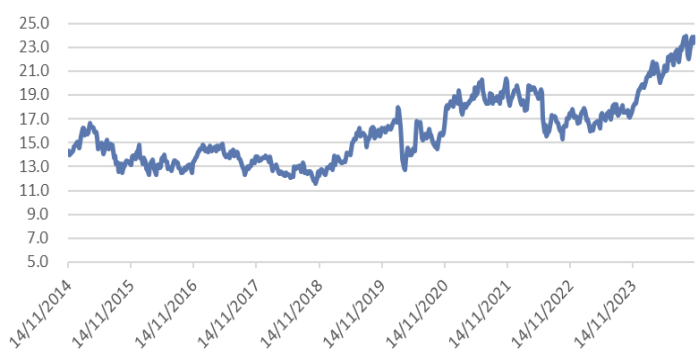
CBA - PE Ratio

Sector leader CBA is now trading at a similar Price/Book value ratio as in 2015 despite ROA being approximately 1/3 lower, which seems anomalous to us. Its PE ratio has risen to the previously unthinkable level of 25, a level usually associated with growth stocks and by far the highest of any developed market bank in the world. The momentum behind the banks may continue for a while, but we would expect some mean reversion over the next 12-18 months.