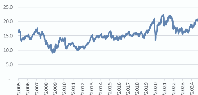
PE Ratio - S&P/ASX Industrials